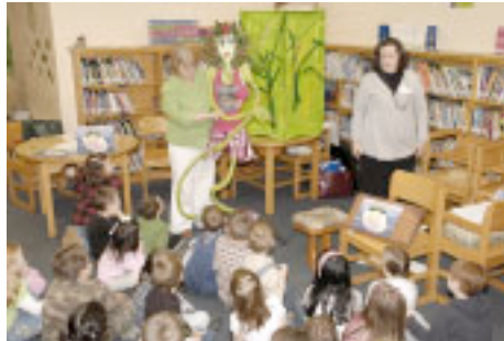
Meet Wild Rose Begonia-everyone loves Wild Rose!